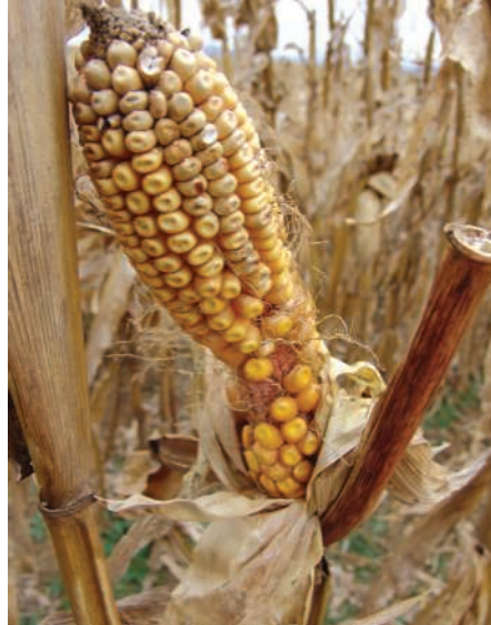
Devastation. Transmitted by the bite of a leafhopper, maize streak virus devastates maize fields across Africa.

The design seemed simple enough: The team studied the proteins necessary for the virus to replicate. If they inserted a mutated viral gene into the plant, which in turn expressed a mutated protein necessary for the virus to replicate at very high levels, it could beat out the virus's normal protein and immobilize the virus, they reasoned.